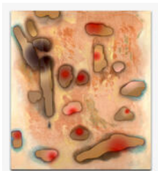
Michele Abramowitz Teething , 2022 Oil and black gesso on polyester canvas 54 x 48 inches (137.16 x 121.92 cm) $12,000.00