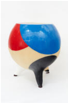
Christopher Chiappa Perfect Orbit , 2014 (Stools) Resin and oil based enamel on styrofoam $8,500.00