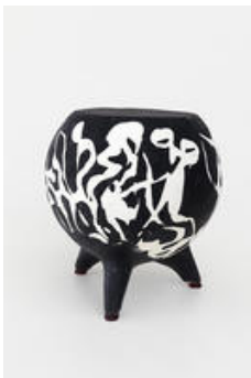
Christopher Chiappa Matisse , 2012 (Stools) Resin and tint on styrofoam $8,500.00