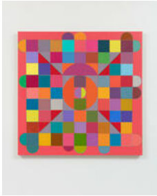
Marilyn Lerner A Lesson To Be Learned , 2022 Oil / wood 36 x 36 inches (91.44 x 91.44 cm) $22,000.00